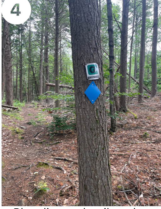
Blue diamond trail marker