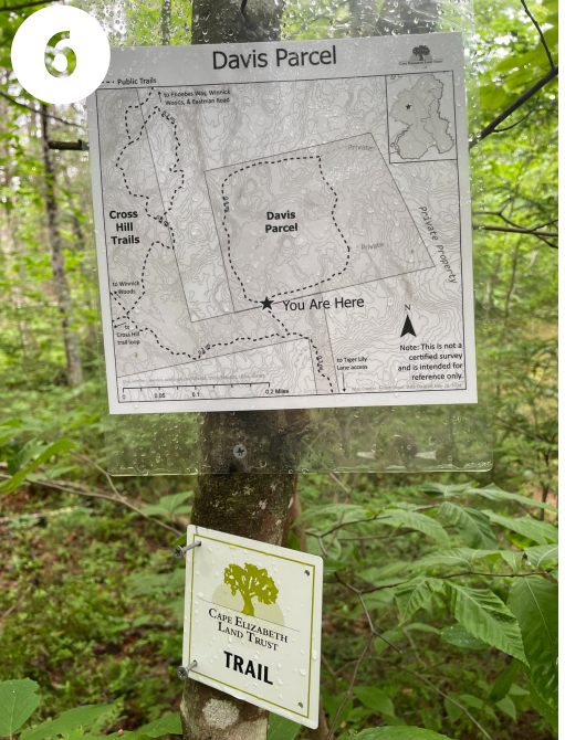
Map of Davis Parcel at intersection of connector and carriage-type trail.