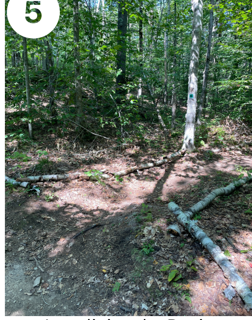
Logs lining the Davis Connector trail. Turn right here!